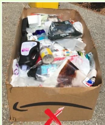
Unacceptable Plastic Recycling Items