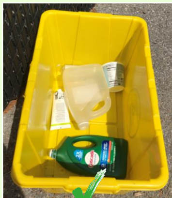
Acceptable Plastic Recycling Items