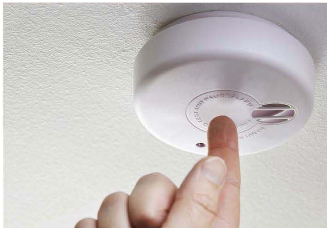
“Test Your Smoke Alarms”